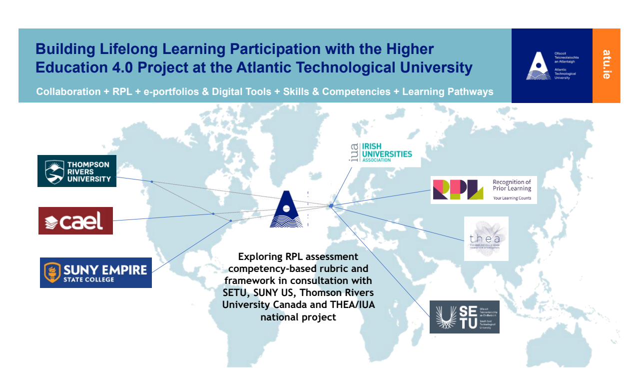
Figure 7: ATU & Partners Driving Enhancement in RPL Experiences